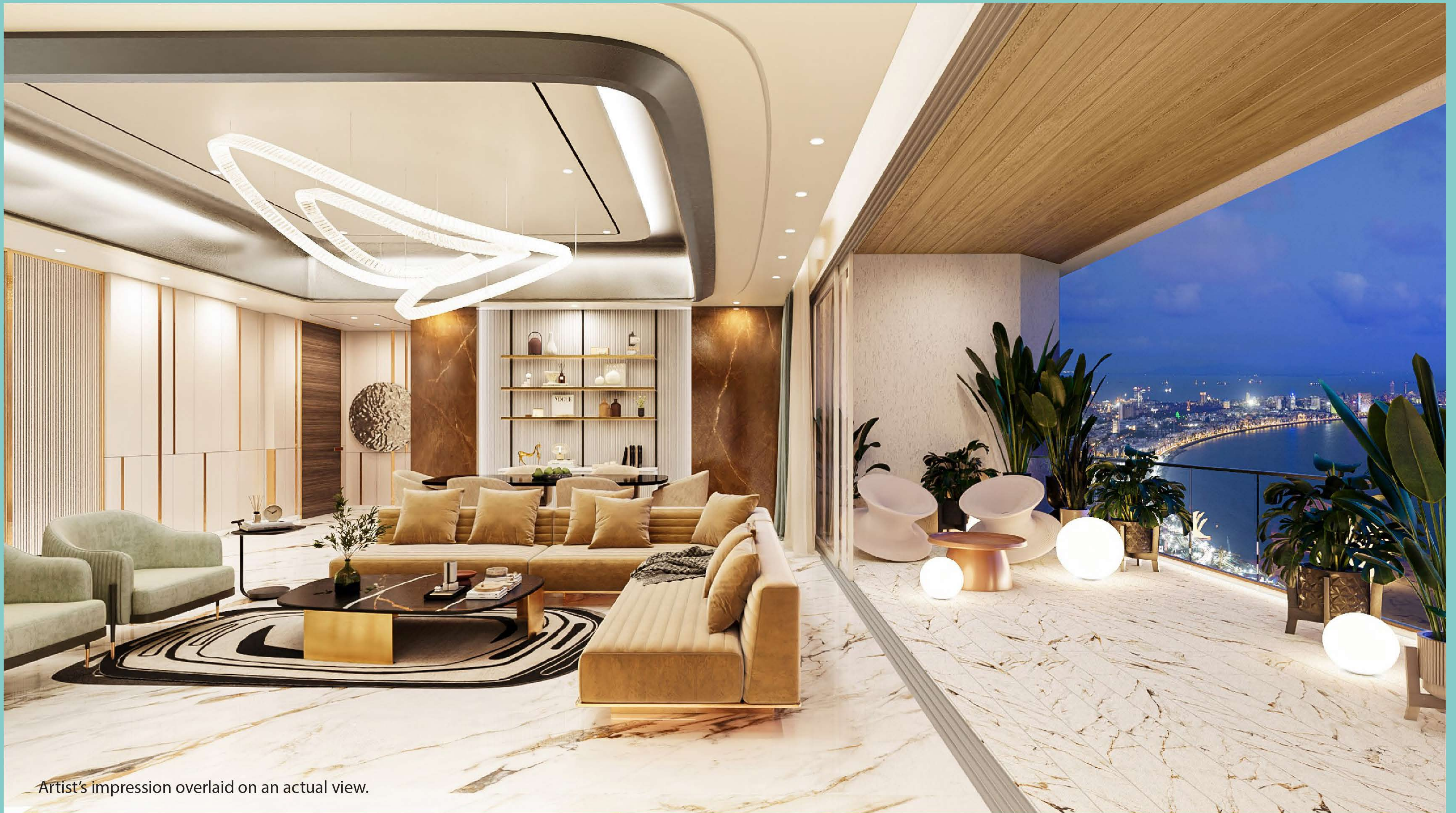
Artist's impression overlaid on an actual view.

Spacious balconies, majestic skies; your perfect haven.