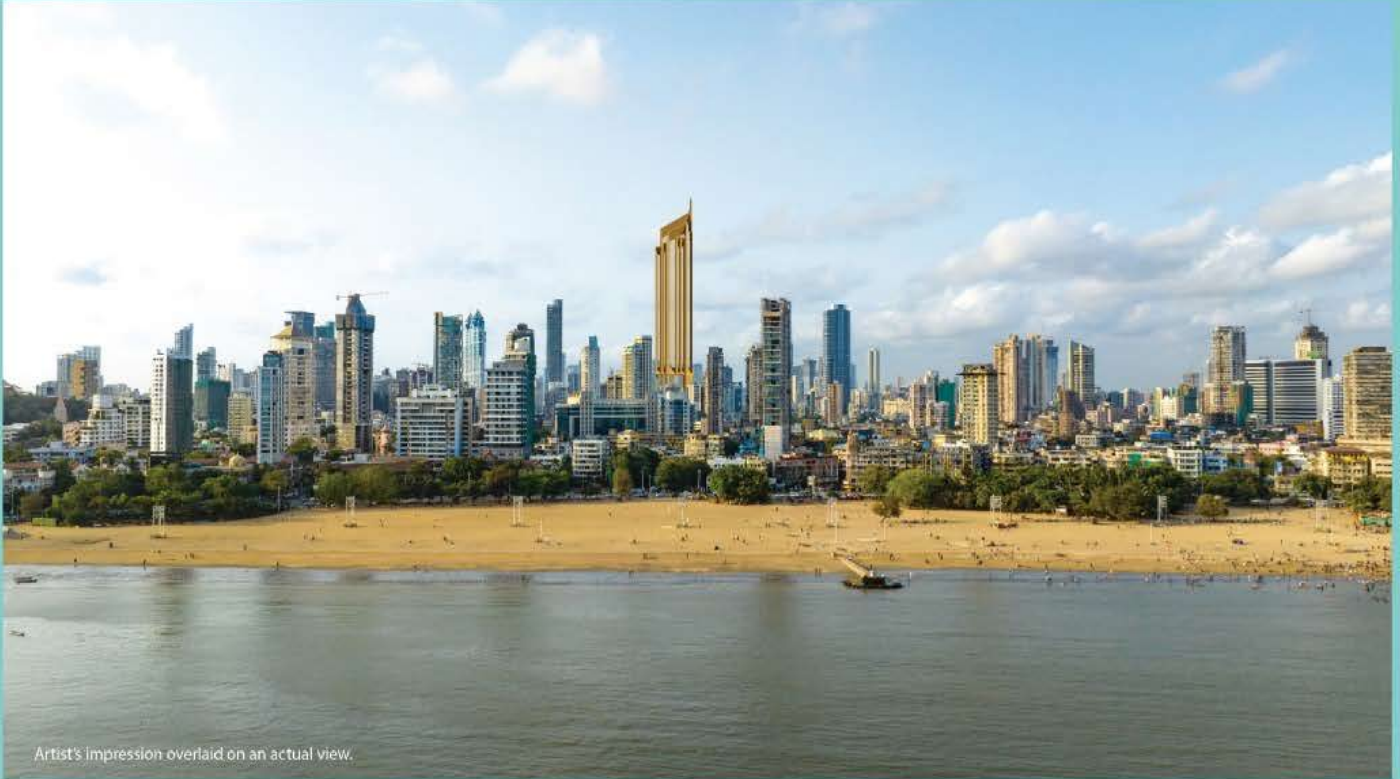
Artist's Impression overlaid on an actual view.

The true makers of South Mumbai scripting a new chapter in their Legacy.