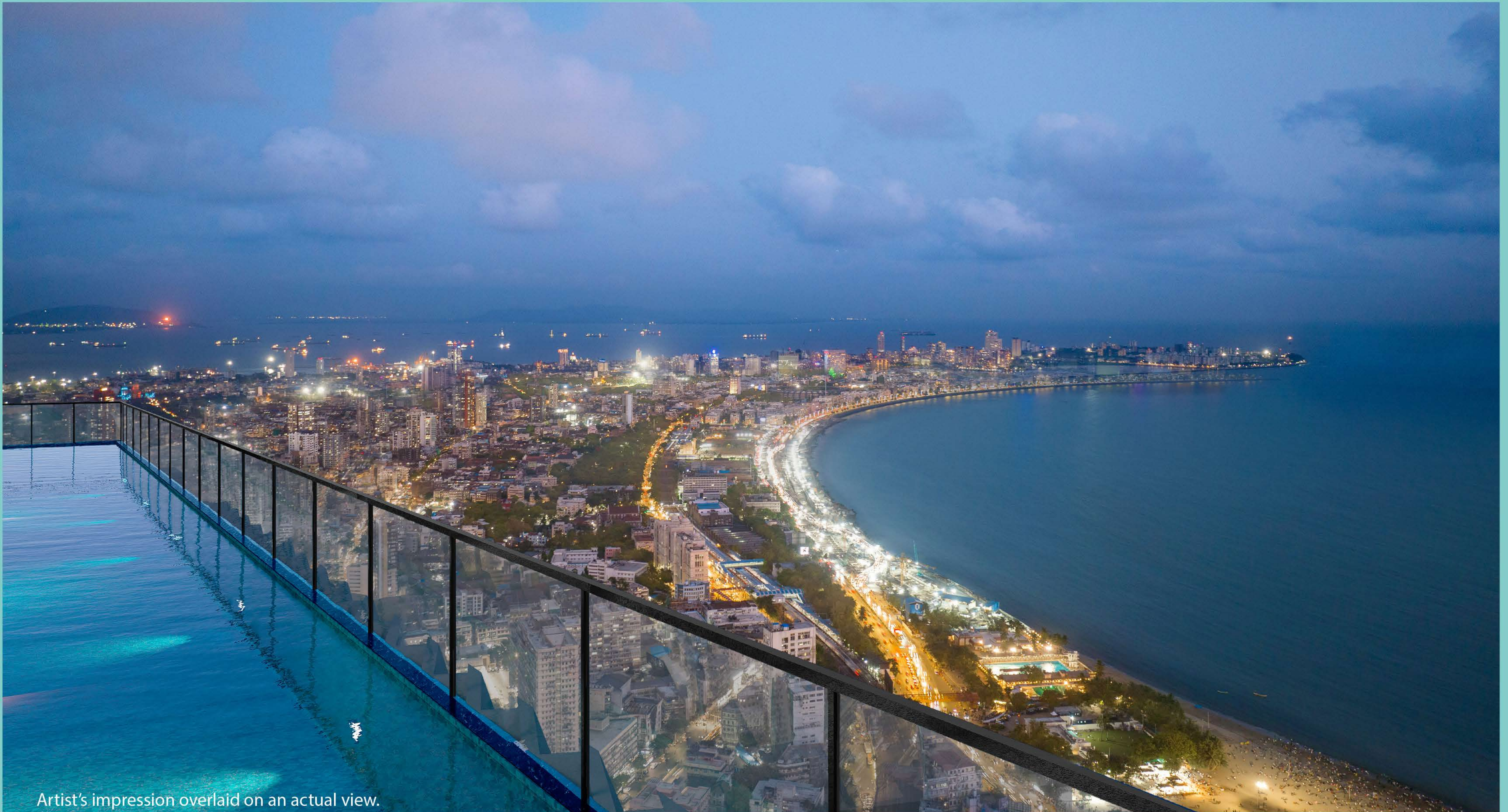
Artist's impression overlaid on an actual view.